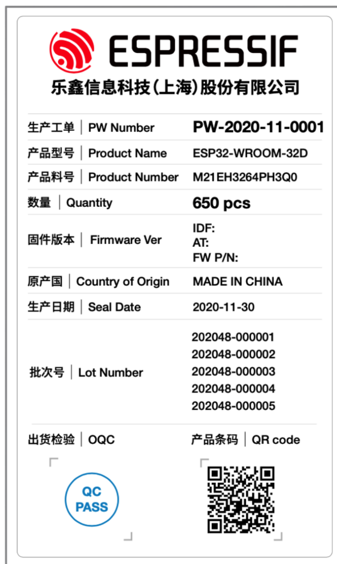
Figure 1.3: Module Product Label

Note: Please note that PW Number is only provided for reels packaged in aluminum moisture barrier bags (MBB).